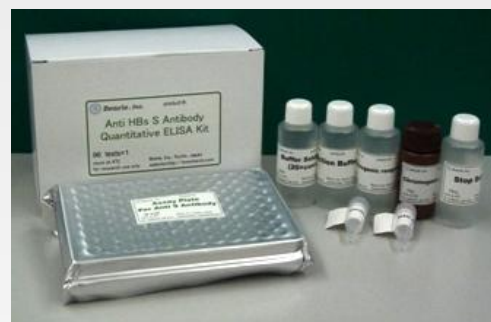
Kit image (Components may be changed without notice.)

All components required for antibody determination are equipped (see back sheet)