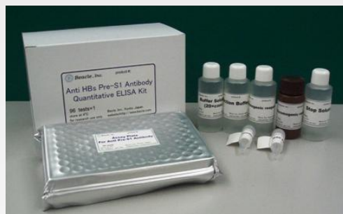
Kit image (Components may be changed without notice.)